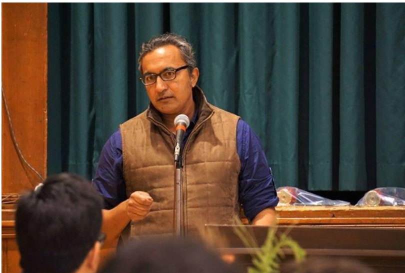
Congressman Ami Bera addressing the audience at the 80 th Anniversary Luncheon