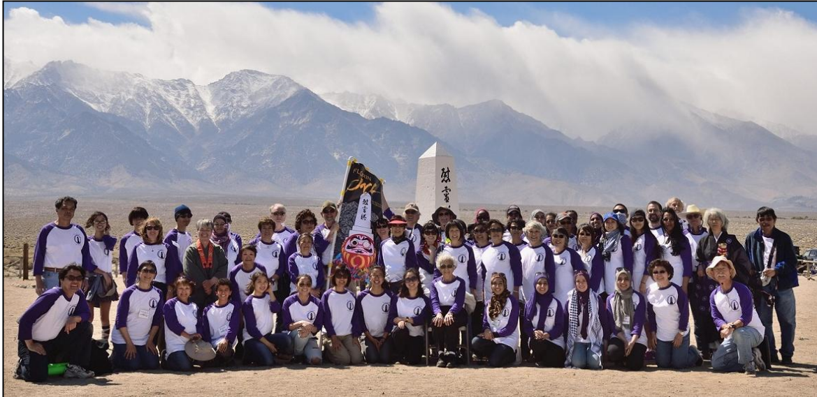
2015 Florin Manzanar pilgrims gather at the camp monument. A dozen former incarcerated journey and generously share their experiences with a diverse group.

A rare opportunity to see, hear, and experience the Japanese American community's World War II incarceration at Manzanar National Historic Park. The best preserved of the 10 major concentration camps awaits you Friday, April 29 to Sunday, May 1, 2016 and is sponsored by the Florin Japanese American Citizens League (JACL) and Council on American Islamic Relations (CAIR-SV) , plus our invited friends.