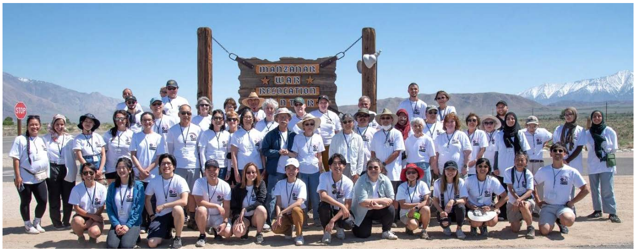
2023 Florin Manzanar Pilgrims in front of Sentry Post Sign.

After a 3-year pandemic break, 55 diverse pilgrims journeyed together and built a community that grasped the importance of “No more backlash, injustice, or Manzanars!” From April 28-30, they traveled 320 miles from Sacramento on a 3-day bus pilgrimage to the former WWII concentration camp located in the shadows of the Sierras near Bishop. The Florin J.A.C.L.-Sacramento Valley and the Council on American Islamic Relations – Sacramento Valley/Central California (CAIR) jointly organized this amazing 15 th annual trip.