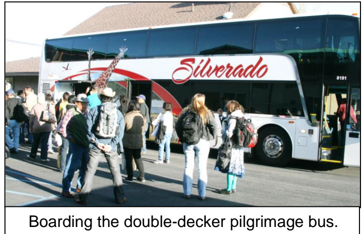
Boarding the double-decker pilgrimage bus.

This awareness-raising April 23 rd 3-day bus journey took travelers 350 miles to the high desert Manzanar National Park on the far side of the Sierra Nevada Mountains just south of Bishop. The pilgrimage was again sponsored by the Florin JACL & the Council on American Islamic Relations–Sacramento Valley (CAIR-SV).