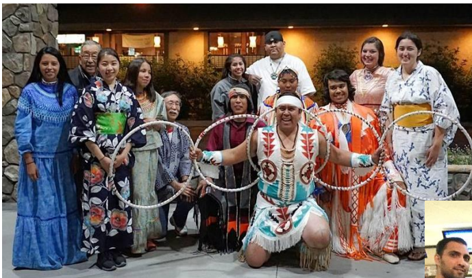
Left Photo: The Native American AkaMya Culture Group generously shared their dances and history with us. We shared a couple of Japanese folk dances.