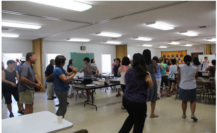
Participants in the Obon Workshop

On July 12, 2016, over 60 people attended the Florin Obon Workshop. This event was jointly sponsored by the Florin JACL and the Buddhist Church of Florin. Attendees enjoyed hotdogs, salads, chips, musubi (rice balls), watermelon and tsukemono (pickled vegetables). Also available were assorted Jello dishes, snacks, and dessert.