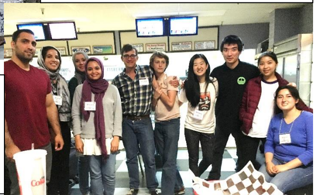
Right Photo: After facing discrimination last year, Muslim and Asian American pilgrims joined with local Bishop residents to integrate a Bishop bowling alley.