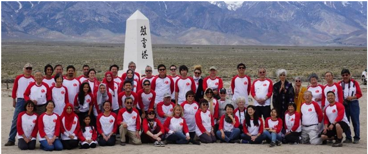
Above Photo: Former camp detainees, family members, diverse peoples including over 20 youth all traveled together on the 11 th Annual Florin Manzanar Pilgrimage. They are pictured at the Manzanar monument on April 30, 2016.

In an important journey for understanding, cultural respect, and justice, fifty individuals from diverse backgrounds traveled together for three days, April 29 th -May 1 st , to the former WWII concentration camp of Manzanar. The group met up with over 1,000 pilgrims from Southern California. This endeavor was jointly sponsored by the Florin JACL and Council on American Islamic Relations - Sacramento Valley (CAIR-SV). The pilgrims shared valuable experiences from the perspectives of both Japanese Americans during World War II and Muslim Americans following September 11 th . A few photos tell the story well: